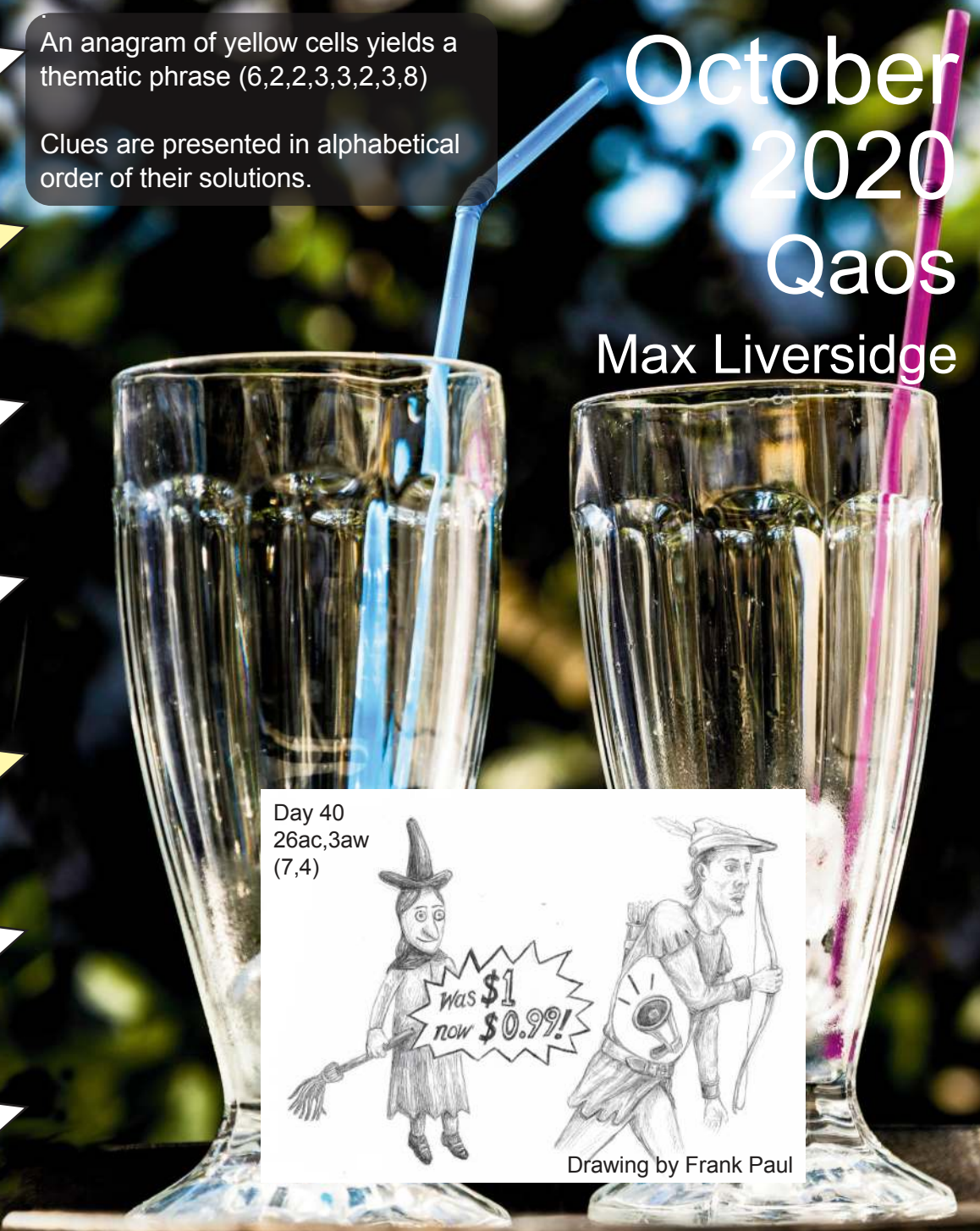
Day 40 26ac,3aw (7,4)