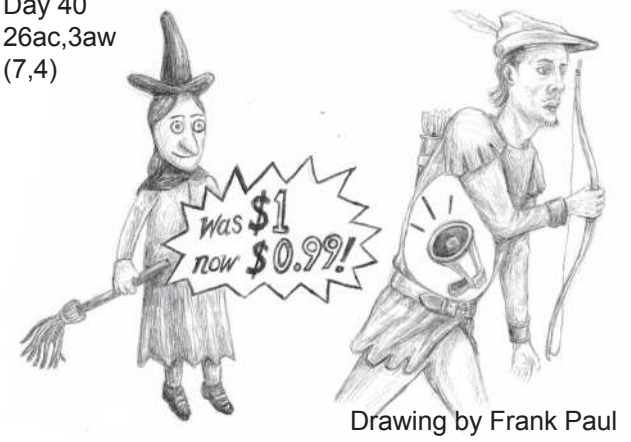
Drawing by Frank Paul