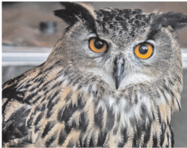
An Eagle Owl by Graham Fox