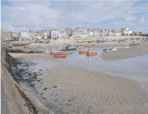
Sirius photography St Ives September

Noting the fiftieth anniversary of a marathon 1,997 performances in the West End run of the musical Hair ending as described in the clue of Day 20. The roof of The Shaftesbury Theatre collapsed. Asterisked clues led to solutions which required shocking treatment (stripping off permitted in UK theatres after Day 26's relaxation of theatre censorship) like the nudity throughout the musical, before entry in the grid. Both solution and grid entry are real words. X in some clues refers to the unclued (HAIRCUT) at 1d or 1d-4,29di-2 (HAIRDO)