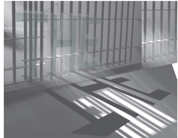
Visual Clue: 'THE barred'

This puzzle noted the 400 th anniversary of the death of William Shakespeare, 23 April 1616, and the 452 nd anniversary of his birth, thought to be on the same day 23 April 1564