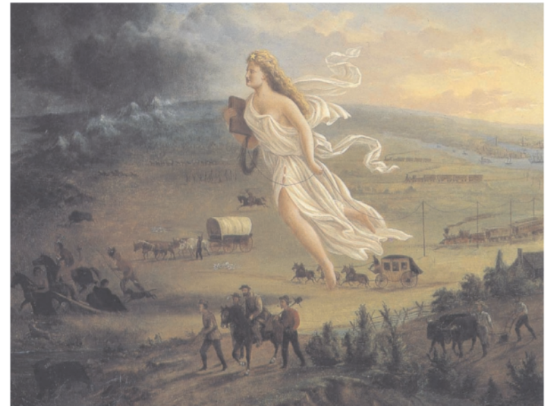
'American Progress' 1872 by John Gast features 'Columbia', a female personification of America - also seen at the start of movies by Columbia Pictures.

This puzzle noted the first orbital spaceflight of NASA's Space Shuttle programme, occurring with the launch of COLUMBIA on April 12 1981.